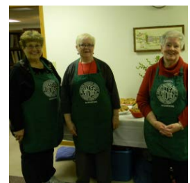
Christmas Open House