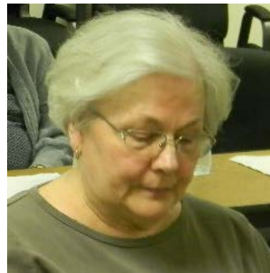
Taking It All In

It was a fun afternoon of stories and memories.