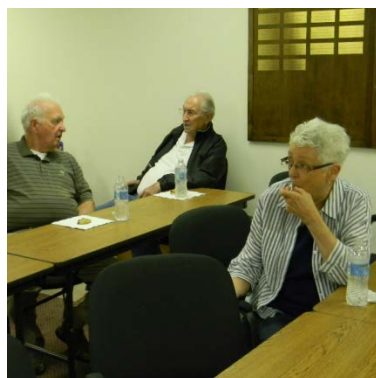
Folks Enjoying the Snacks